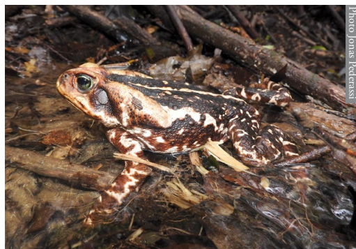
Figure 1: The recorded female of Rhinella icterica (voucher specimen MN 92843).

(SVL = 123 mm) (Figure 1). The call was obtained, on the 27 th of December 2016, in Serra Verde (22°09'03"S / 44°32'24"W, Datum WGS 84; 1,622 masl), located in the upper Grande river basin, in the District of Santo Antônio, Municipality of Bocaina de Minas, State of Minas Gerais, Brazil, in the Mantiqueira mountain range, Northwest portion of Área de Proteção Ambiental da Serra da Mantiqueira. The record was obtained in a Tascam DR05 recorder with a Rode NTG2 shotgun microphone at a distance of 20 cm from the calling female while it was caught by the index and thumb fingers just behind the forelimbs, like an amplexus. The record parameters were set in 24 bits and 48 kHz of resolution. The analysis was made in Raven Pro 1.5 (Cornell Lab, 2017) with FFT in 512 points and window resolution in Hann. The call parameters follow Köhler et al. (2017), being call duration in seconds, interval between calls in seconds, call rate (call/min), notes per call, note rate (notes/second), dominant frequency in kHz, frequen-