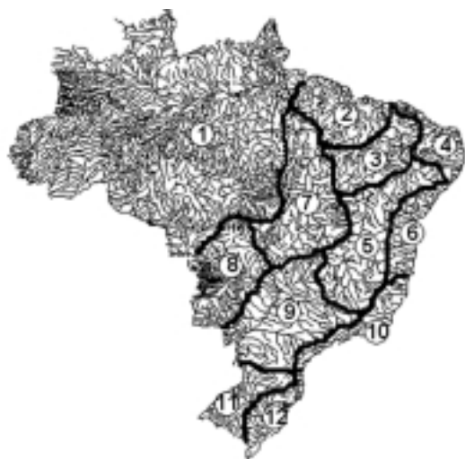
FIGURE 1. The 12 Brazilian river drainage considered in this study. 1: Amazon, 2: Atlantic-Northeastern, 3: Parnaíba, 4: Atlantic-Northeastern Orient, 5: São Francisco, 6: Atlantic-East, 7: Tocantins, 8: Paraguay, 9: Paraná, 10: Atlantic-Southeastern, 11: Uruguay, 12: Atlantic-South. Adapted from Brazilian Hydrological Information System (2003).

FIGURA 1. Las 12 cuencas hidrográficas brasileñas consideradas en el presente estudio. 1: Amazon, 2: Atlantic-Northeastern, 3: Parnaíba, 4: Atlantic-Northeastern Orient, 5: São Francisco, 6: Atlantic-East, 7: Tocantins, 8: Paraguay, 9: Paraná, 10: Atlantic-Southeastern, 11: Uruguay, 12: Atlantic-South. Adaptado de Brazilian Hydrological Information System (2003).