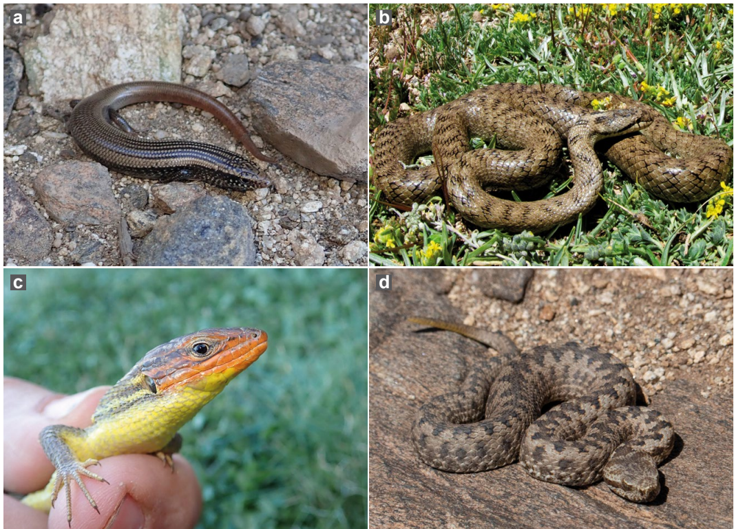
Figure 2: Photos of selected species found in the Tichka Plateau. a) Chalcides montanus , b) Coronella girondica , c) Psammodromus algirus , d) Vipera monticola .

Figure 2: Fotos de especies seleccionadas encontradas en el páramo de Tichka. a) Chalcides montanus , b) Coronella girondica , c) Psammodromus algirus , d) Vipera monticola .