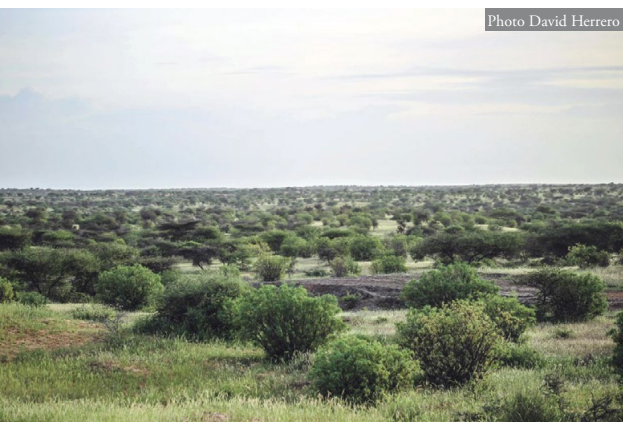
Figure 2: Habitat of S. fasciatus fasciatus . Figura 2: Hábitat de S. fasciatus fasciatus .

precise source (Geniez et al. , 2004), and three in Trarza province: La' Bâra (Le Berre, 1989), 30 km North West of Rosso (Böhme et al. , 2001), and Lahouich (Trape et al. , 2012; J.C. Brito, personal communication). Scincopus spp. has been reported from several types of habitats dominated by arid and semi-arid climate in North Africa, from sandy regions to areas of savannah (Geniez et al. , 2010; Trape et al. , 2012).