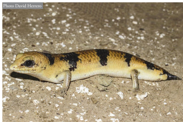
Figure 3: Specimen of S. fasciatus fasciatus . Figura 3: Ejemplar de S. fasciatus fasciatus .

The lack of biological data for Scincopus sp. from the western range of its distribution makes it the target to develop future expeditions, aimed at increasing the knowledge on the biology, ecology and conservation status of this enigmatic species, currently catalogued as "Insufficient data" in the IUCN Red List (Geniez et al. , 2010).