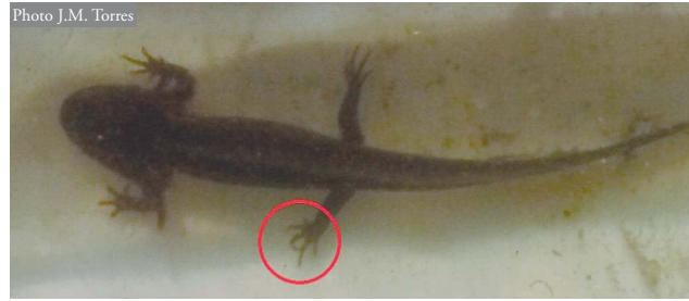
Figure 4: Third specimen, larval sharp-ribbed newt, and limb deformity.

Figura 3: Segundo individuo, macho adulto con deformidad en la extremidad posterior izquierda.