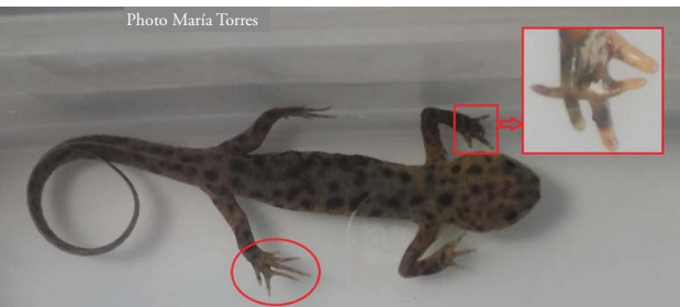
Figure 2: First specimen, male adult sharp-ribbed newt, and limb deformities.