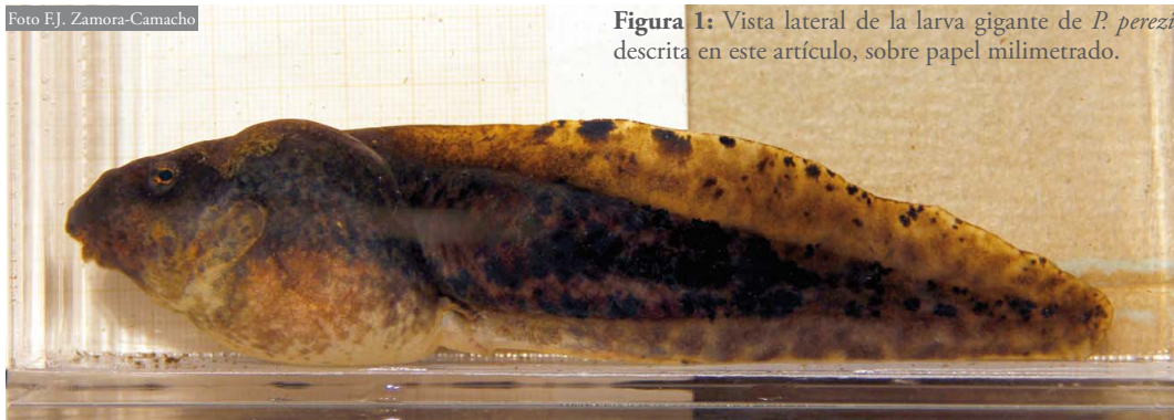
Figura 1: Vista lateral de la larva gigante de P. perezi descrita en este artículo, sobre papel milimetrado.