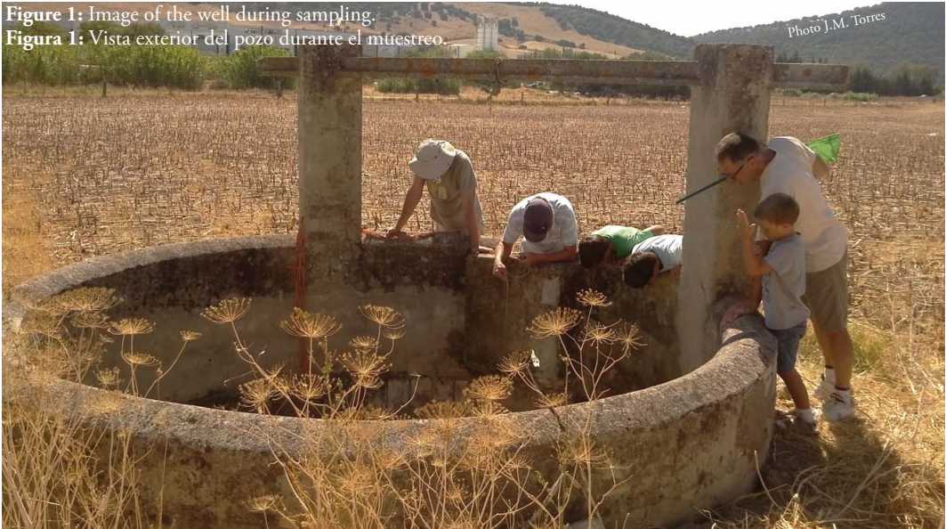
Figure 1: Image of the well during sampling. Figura 1: Vista exterior del pozo durante el muestreo.

prevents the accidental fall of newts into the well (Figure 1). The landscape around the well is dominated by extensive cultivation of sunflowers and pasture for livestock, so the groundwater is mainly used by animals for drinking, and not for irrigation.