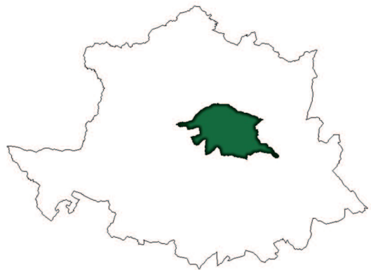
Figura 1: Provincia de Cáceres y situación del Parque Nacional de Monfragüe y su Zona Periférica de Protección.

El estudio de los anfibios en el Parque Nacional de Monfragüe se puede considerar muy escaso pues, a excepción de un trabajo no publicado (Muñoz, 2002), no existe ninguno que haya tenido por objeto el estudio de este grupo de vertebrados en este espacio protegido. Varios trabajos recogen datos del mismo pero con un área de estudio mayor (Barberá et al. , 2006; Muñoz, 2002; Muñoz et al. , 2005; Muñoz et al. , 2012; Palomo, 1993). El presente trabajo tiene Para ver Anexos ir a < http://www.herpetologica.es/publicaciones/ >