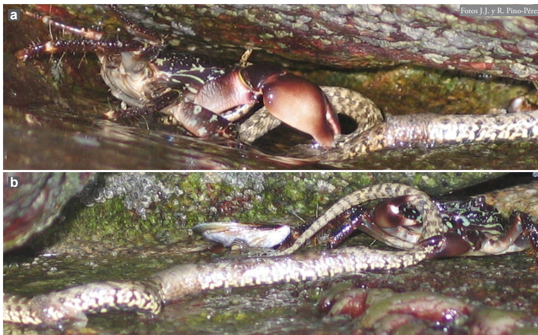
Figura 1: Natrix maura atacadas por: a) un macho y b) una hembra de Pachygrapsus marmoratus a 2 m de profundidad en una grieta intermareal, el 29 de julio de 2004, en Cangas, Pontevedra (29T 516485; 4677602).

atacando diferentes especies de blénidos y góbidos. Según nuestras observaciones, en las áreas costeras del municipio de Cangas (Pontevedra), los individuos suelen ser menores de 60 cm de longitud total y se alimentan principalmente del blénido Lipophrys pholis (Linnaeus, 1758), del góbido Gobius paganellus Linnaeus, 1758 y del